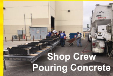
Shop Crew Pouring Concrete